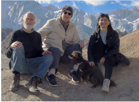
On a Family Pandemic Trip