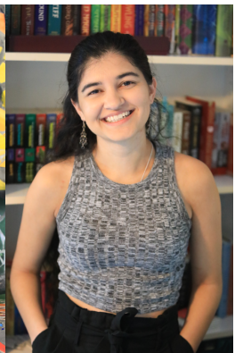
With the Collection