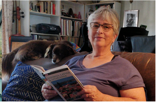
Trip Planning With Sherlock

moving on to Glasgow, Scotland, followed by (this is true) living in or at least visiting Romania, Bulgaria (which should count twice because she lived in Sofia), North Macedonia, Armenia, Serbia, and now Georgia again. (Albania is in her plans for the spring.) The reality is that we would lose track of where she was and where she'd been except that she sent us postcards that said "Looking forward to your next visit" but arrived long after we've done that and come home again. She claims to have sent a card from Mars-ia but it hasn't arrived yet even though we keep calling SpaceX to check.